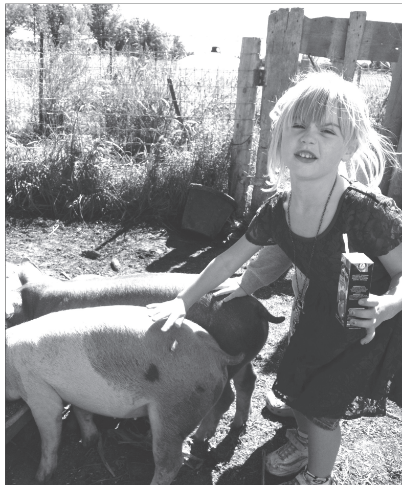
Faith Fawns and a visitor to our farm pat our little living green bins Petal and Oink. These girls are Tamworth crosses and are as friendly and bright as any domestic dog.